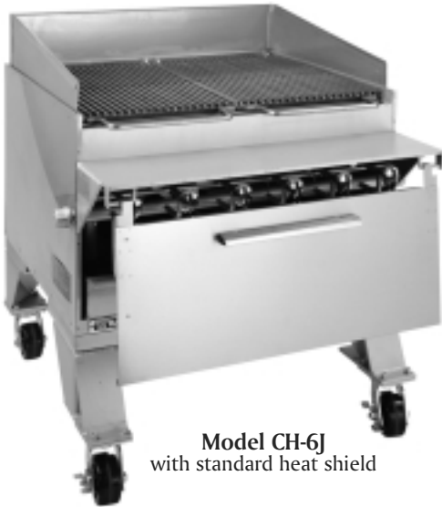
Model CH-6J with standard heat shield