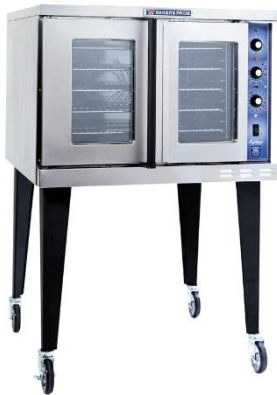
GDCO-E1 w/optional casters